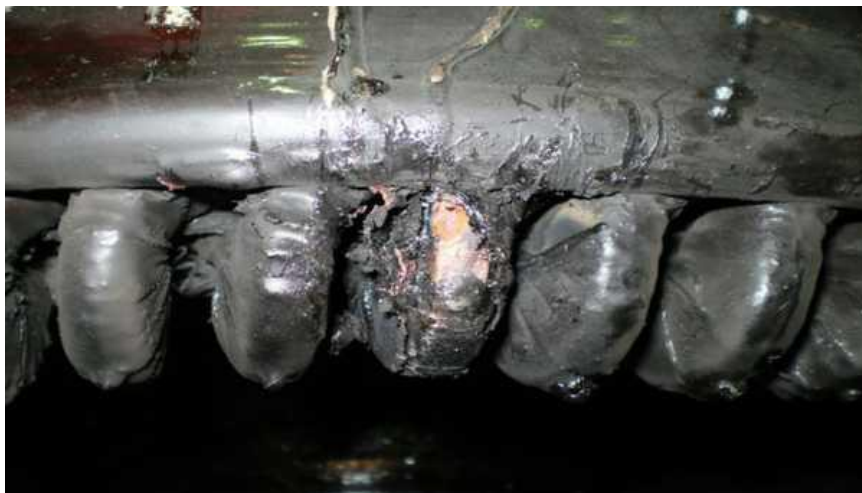
Fig. 1. Fragment of damaged insulation on the frontal part armature winding electric machine

With such damage, the most expedient and effective method will be to extend the life of the insulation by encapsulating local damage using impregnating materials and heat radiation.