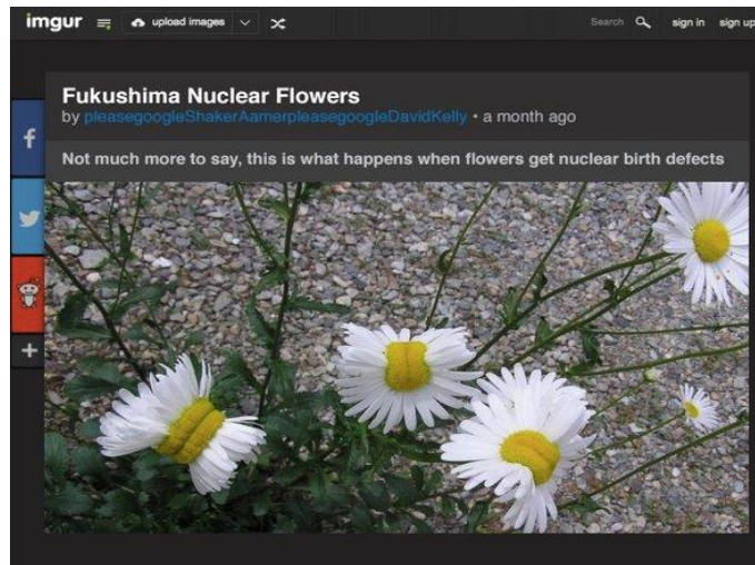
Fig. 1. A site where high school students were asked to evaluate the reliability of information as part of a Stanford University study.

about the appearance of double flowers in the vicinity of Fukushima was illustrated by a photo (see Fig. 1)