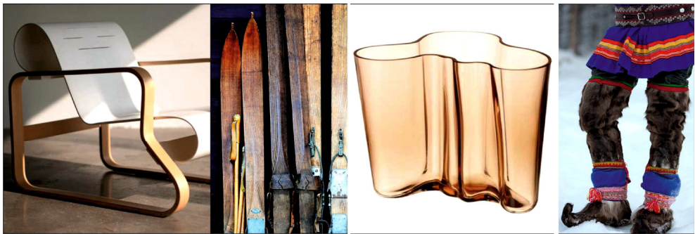
Fig. 5. A. Aalto «Armchair «Paimio N 41». Traditional Scandinavian bent wood skis. A. Aalto, A. Marcio vase «Savoy». Traditional trousers of the Sami and Lapps (Lapland).

This model synthesizes a new look, a new reading, a new modern approach to the national, which is adapted to modern needs and translated into the international. The international often turns to the original roots of the national handicraft in search of new ideas, motivation and inspiration. These are countries with a strong influence of traditional handicraft shaping and a developed industry. In this type, industrial design is constantly fuelled by the ideas of traditional craft shaping. The graphic display of such a model can be branched or sinusoidal with different amplitude fluctuations. According to this scenario, design is being developed in Scandinavia and Italy. Scandinavian shaping is unique in nature, its features are the use of natural materials, natural forms, lightness, deliberate modesty, simplicity, respect for craftsmanship and traditions. The aesthetics of Scandinavian modernism influenced the world design culture of the mid and late 20 th century the most. It changed not only things, but it also became the model for a new European lifestyle (fig. 5).