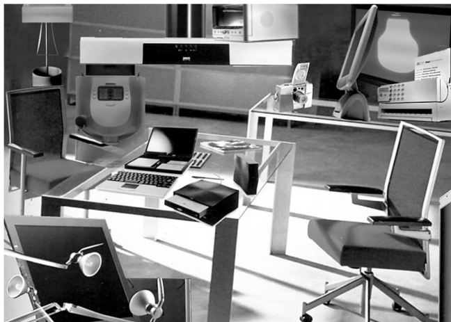
Fig. 1. Design objects of the industrial era.

At first glance, the answer to the problem of national and international components in architecture and design posed in the article is obvious and lies in the name itself. It is enough to change the places of the words and we get something that satisfies everyone: «national in architecture and international in design». Industrial design has no nationality; mass production makes it international. However, this simplicity of the answer is only apparent.