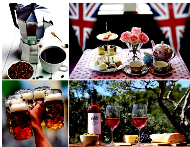
Fig. 2. The surviving customs and traditions are associated with national characteristics.

The surviving customs and traditions are associated with national characteristics: Italian coffee, English tea, German beer, French wine, Uzbek pilaf, etc. These traditions and customs often become a kind of motive for the industrial production of products specific to a particular country or place (fig. 2) [30].