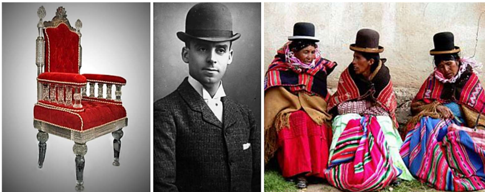
Fig. 7. F. and S. Osler «Glass armchair for Maharajah Sajjan Singh». Bowler hat. Quechua Indian women today, Bolivia.

This model is a kind of antipode of the previous model. The whole history of human relationships is a continuous series of conquests of some peoples by others. And in this sense, it is interesting to study not only how the culture of the colonized people interacts with the colonizer, but also the reverse process. About this type of model, we can say that it is fully or partially realized when one national culture influences another national culture. Thus a new national model arises, which carries a conglomerate of characteristics of two or more nations. As an example – the colonial model (Australia, India, some regions of America and Africa). This is how a colonial design style arises, which goes from the East to the West and conquers Europe. Sometime it becomes very popular in European countries (fig. 7).