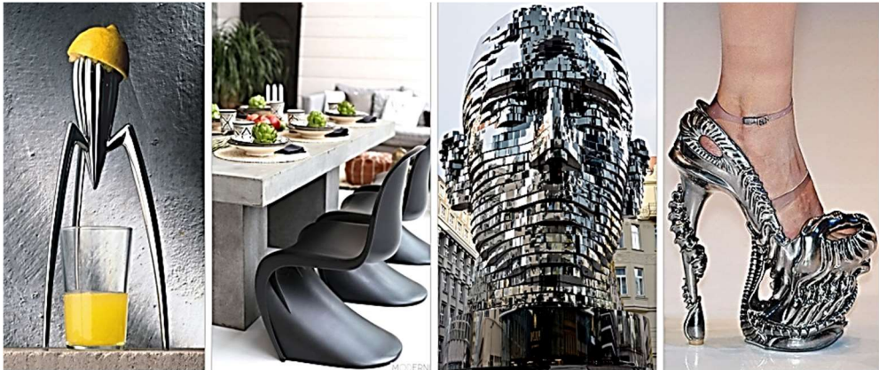
Fig. 8. Philippe Starck «Juicy Salif». Verner Panton «Panton Chaire». David Cerny «The Head of Franz Kafka». Alexander McQueen «VOSS».

functionalism even more international and harmonious (streamline, bionics). This type shows us a clear vector of design development, with a precisely chosen pathway, often either limited by some factors or the style predisposition of the country. The traditions of functionalism have always been especially strong in this country. Functionalism is promoted as a national treasure, a special attitude towards design quality, safety, production technology, production efficiency, and ease of use is cultivated. German design has traditionally been associated with modernism and has come to be regarded as an «international style» (fig. 8).