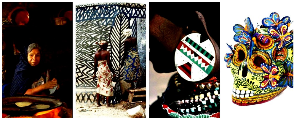
Fig. 3. Traditional cooking by Mexican women. Traditional village structure from Tiebele, West Africa. The Zulu Nation of South Africa. Alfonso Castilio Horta.