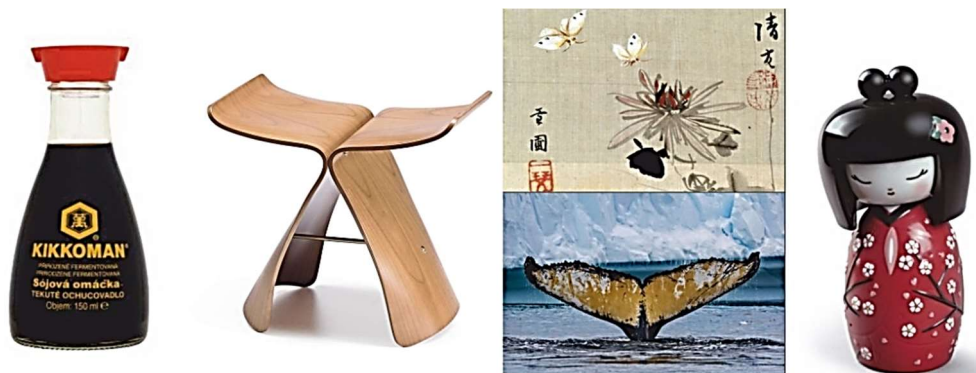
Fig. 4. Bottle of Kikkoman soy sauce, stool «Butterfly» by Sori Yanagi in comparison with the shape of a butterfly from an engraving by J. Baitsu (c. 1840) and the shape of a whale's tail, traditional Japanese kokeshi mascot doll.

In this model, a clear line of national shaping is traced, the basic techniques of which become the basis of industrial design. In such facilities, the national component is especially felt in the output, and at the same time it conquers the world market, becomes international, without losing its original «ethnic».