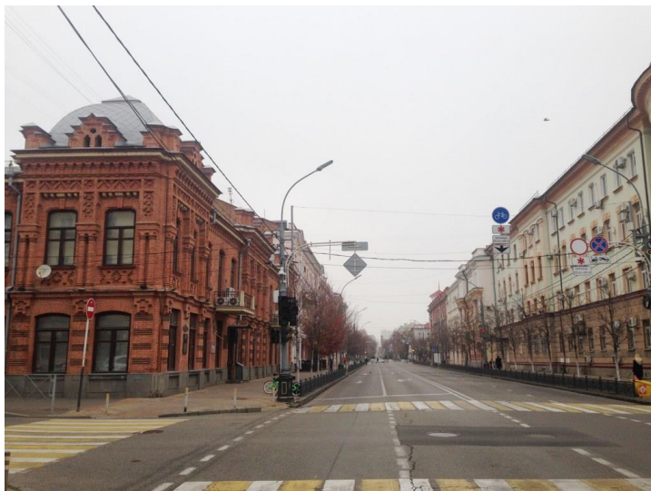
Fig. 1. The historical center of Krasnodar. North side Krasnaya Street at the intersection with Komsomolskaya Street (Headquarters). On the left is the house of General I.K. Nazarov (built in 1889). Modern look

Considering the relevance of the stated topic, it should be noted that within the boundaries of six settlements of the Krasnodar Territory - Anapa, Armavir, Yeysk, Krasnodar, Sochi and the village of Taman, the center has the legislative status of a historical settlement of regional significance (Fig. 1).