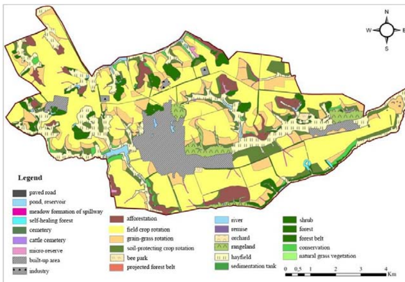
Fig. 3. The project of an adaptive-landscape farming system of JSC "Druzhba".

The results of agro-ecological assessment of lands, physical-geographical and economic features of land use determined the possibility of soil protection arrangement of the territory of Druzhba (Fig. 3).