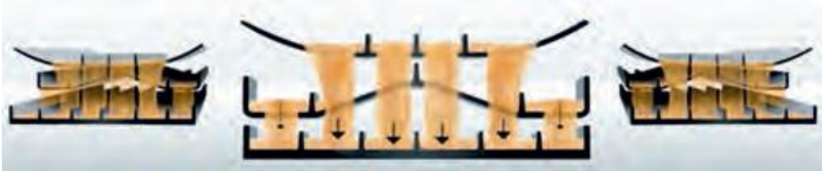
Fig. 1. Distribution of grain heaps by grain boards.