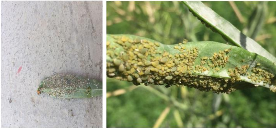
Fig. 3. Process of feeding on the aphids of the eleven-pointed beetle ( Coccinella undecimpunctata ).

In our research, we found that fruit trees (apples, peaches, apricots, pears, plums, almonds, and walnuts), willows, poplars, spruces, shrubs, as well as rosehip, hawthorn is more common. Fruit trees, grasses, cotton lice clusters, and grain plants were collected in large numbers. In addition to the plant lice found in the above-mentioned plants, the eleven-spotted beetle and larvae also feed on plant flower nectar (Fig. 3). The eleven-pointed beetle develops by breeding twice a year. Beetles overwinter mainly in the mountains, and partly beetle populations have also been found to overwinter in the plains.