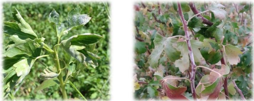
Fig. 1. Infection of leaves and twigs of Cassis with powdery mildew disease.

The primary conidia of the fungus that cause cassis powdery mildew are lanceolate in shape, measuring 38-80 \times 11-19 \mu\text{m} , and averaging 56.1-13.7 \mu\text{m} . Secondary conidia are also cylindrical or slightly enlarged in the third part, measuring 42-63 \times 12-18 \mu\text{m} . Conidia are long, cleistothecia dark brown, large, 150 \times 255 \mu\text{m} in diameter. The structure of the peridia is uncertain. When crushed, it was found that the cells in it were angular and had a diameter of 9-12 \mu\text{m} . It was noted that the tumors of Cleistothecia were once branched, angular-serpentine, and they did not last long, and their size was found to be 60-90 \times 6 \mu\text{m} . It was noted that the Clytothecia had many sacs, which were elliptical in shape and measuring 60-75 \times 27-32 \mu\text{m} . Ascospores were found to be elliptical and measuring 27-33 \times 12-15 \mu\text{m} (Fig. 1).