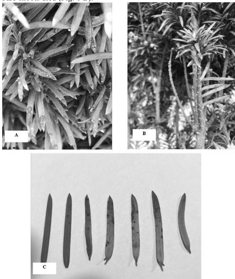
Fig. 1. Manifestation of C. taxicola on the vegetative organs of Taxus baccata . A) Acervules on needles of needles; B) Stripping of shoots and their subsequent death; C) the Degree of necrotic lesion of needles in the development of pustules.

Phytopathological examination of yew trees showed that in a mild winter, signs of C. taxicola damage persist on the vegetative organs of the previous vegetative period. In arid conditions, the fruit bodies of the pathogen in the place of pustules had a black and wrinkled appearance (Fig. 1 A). With the beginning of vegetation, the affected needles fell off, and the bare shoots died (Fig. 1 B).