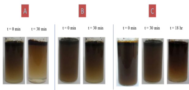
Fig. 1. Emulsion formed between Arab crude oil and sea water: (a) 100% [Cho][Lau], (b) 100% LS, and (c) 40% [Cho][Lau] + 60% LS.

exhibited high stability for a longer span of time than individual [Cho][Lau]. On the other side, the emulsion formed by the developed formulation (40:60 ratio of [Cho][Lau] and LS and) (Fig. 1C) was almost similar at t = 0 minutes and t = 30 minutes, indicating more stable emulsion formation as compared to the first two cases. Moreover, for the third case, the developed formulation was able to produce emulsion which was stable when observed even after 18 hr of mixing time, illustrating a very low degree of coalescence and creaming (Fig. 1C). Hence, all these results showed that the developed formulation have the capability to form a more stable emulsion of Arab crude oil in synthetic sea water.