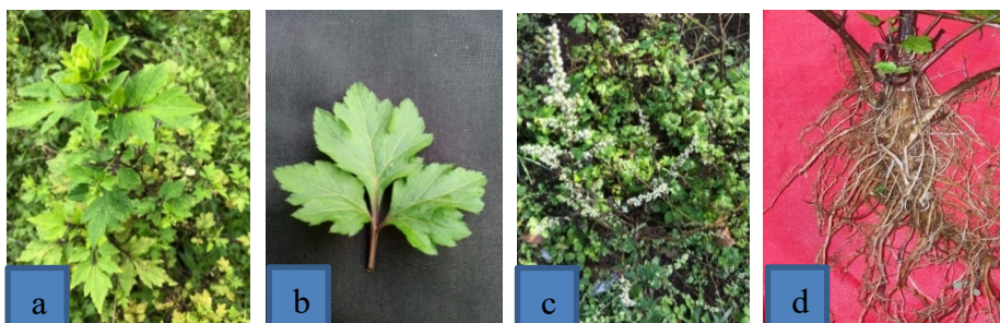
Fig. 3. Morphological characteristics of valerian parent plant: a) habitus, b) leaf, c) flower, d) roots.

Valerian from in vitro culture possessed similar morphology as the parent plant because the explant sources for in vitro propagation were from vegetative parts/rhizome [7]. Plant propagation through in vitro culture using vegetative explant as sources material will produce similar planting material as the parents as long as using PGR in a low concentration, especially Benzyl adenine (BA). However, genetic variation could occur in undifferentiated cells (callus phase), isolated protoplast, tissues, and morphological traits of in vitro raised plants. It can be induced by many factors such as PGR, explants source, subculture period, and also culture condition [10,11,12].