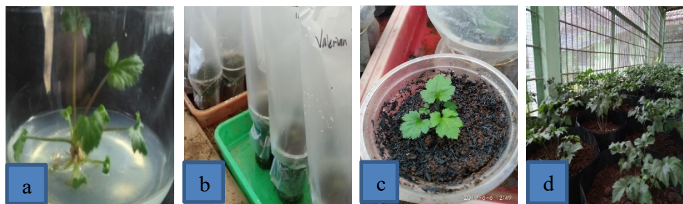
Fig. 1. Valerian acclimatization: a) valerian plantlets, b) acclimatized plants, c) one-month-old-acclimatized valerian, d) valerian at two months after planting.

The research was conducted at the greenhouse of ISMCRI Bogor (240 m asl), West Java, Indonesia. The planting material used was valerian plantlets derived from in vitro culture. Valerian plantlets were removed from culture bottles and washed to remove the agar (Figure 1a). The plantlets were then transferred into a small plastic cup containing sterile media (soil, compost, and husk), covered by a polyethylene bag to maintain the humidity (Figure 1b and c). The polyethylene bag was opened gradually at two weeks after transplantation, and in one month, it was removed entirely. The plants were maintained in the greenhouse for three months. The 3 month-old valerian was then planted in a 40 cm x 50 cm polybag filled with soil and manure (2 : 1) as growing media. The plants were maintained in the greenhouse until 5 months old and then relocated to the outside greenhouse. The plants were harvested at 9 and 12 months after planting (MAP).