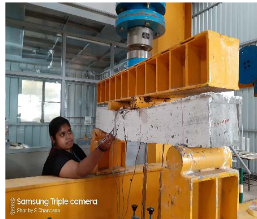
Figure 3. RCC Beam after Testing