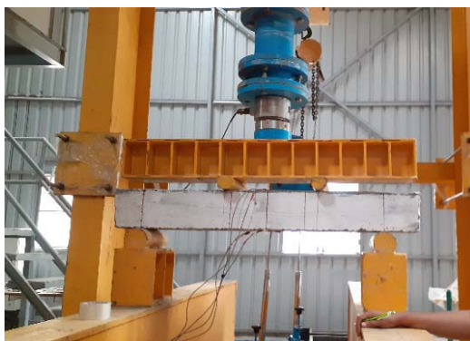
Figure 2. RCC Beam before Testing