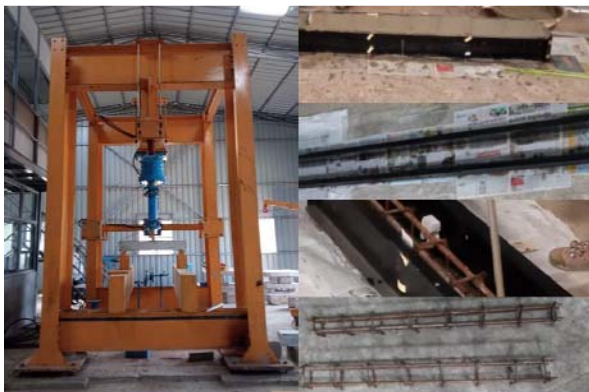
Figure 1. RCC Beam Setup for Testing

For beams testing, a hydraulic loading frame with a capacity of 200 tonnes is used. For diversions in the range of 10mm, linear variable differential transducers (LVDT) with a minimum tally of 0.01mm are used. To obtain strain in the example, strain check sensors are added to the example. LVDTs, strain gauge sensors, and burden shells are connected to the Signal conditioner/marker via pre-programmed No ports in the charge unit. With a proper stacking rate increment the heap bit by bit till example twists/breaks. The robotized information procurement framework is utilized to dissect the information during the experiment. Observe the break designs on the example and get the information gained from the framework to additionally come to results and end results.