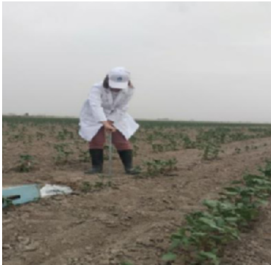
Fig. 3. Determination of soil moisture before watering.

Throughout the growing season, systematic observations were made of the dynamics of moisture within the active soil layer, and the actual moisture content and moisture content before and after irrigation were established.