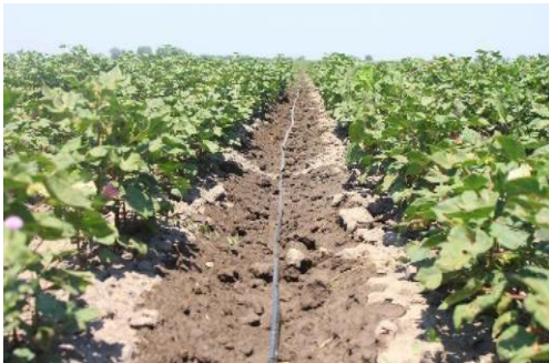
Fig.5. Irrigation pipeline with drippers