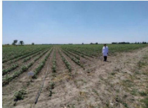
Fig.4. Preparation for irrigation of cotton in the experimental area.