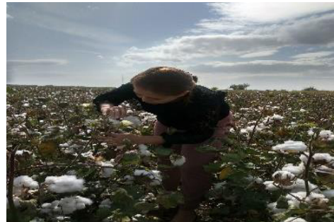
Fig.6. Preparation for harvesting cotton of the experimental plot.