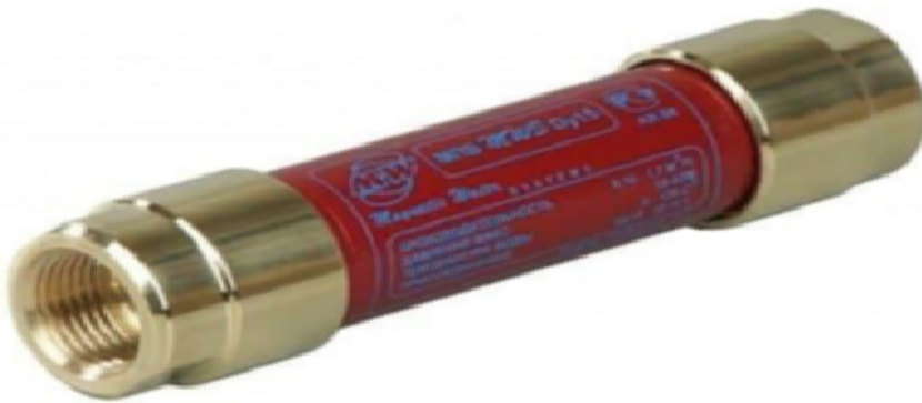
Fig 1. Magnetic water treatment device "MPV (magnetic water transformation) MWS Dy 15".