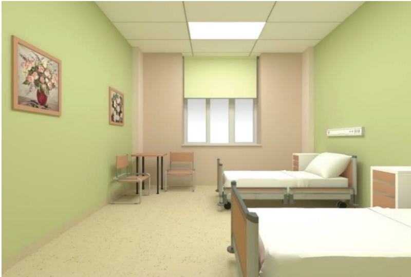
Fig. 4. Ward.

helps a disabled person to move from a wheelchair to a bed or other options. The above examples of the interior solution are quite acceptable for M1, 2, 3 groups of disabled people.