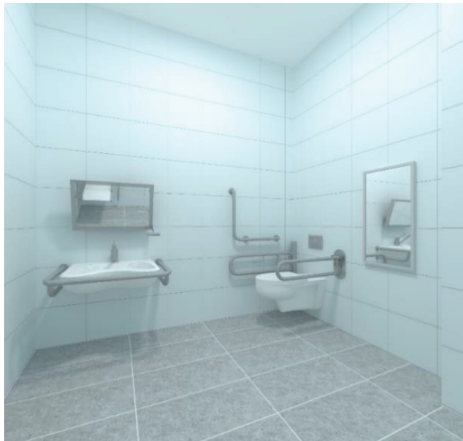
Fig. 3. Specific features of equipment in the lavatory for disabled people.

The space planning of ward departments has a tendency towards approaching the space formation according to the principle of a dwelling unit. Therefore, the color scheme of a ward need not differ from that of any room in an apartment. It is possible to provide for a multi-version solution of the ward interiors in one department, both using light colors and in more saturated versions (Fig. 4 and Fig. 5). However, the furniture arrangement should take into account the accessibility for a wheelchair user. The ward should have specific equipment that