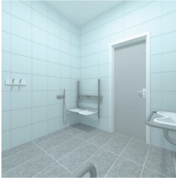
Fig. 2. Lavatory for disabled people.