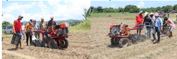
Figure 1. Onion farmers' hands-on operation of the onion harvester.

A total of 26 respondents that operated the onion harvester were given questionnaires and collected right after the field test. It involves 7 females and 19 males. Purposely, to ascertain if the machine is gender-sensitive that could be operated by both sexes. During the answering of the questionnaire, a project staff carefully explained it to each respondent. Thus, no missing important data in the collected responses.