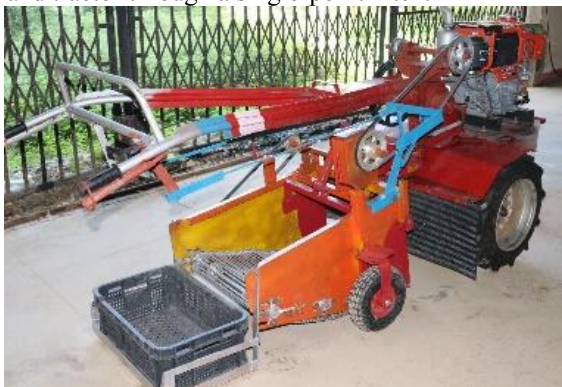
Figure 3. Prototype onion harvester attached to hand tractor.

The onion harvester designed for the Philippine field condition (Fig. 3) is a machine that combines digging, lifting, cleaning, and collecting onion simultaneously in one operation. It is a machine that harvests a 50 cm wide plot or a single plot with 6 to 7 hills/row. The onion harvester weighs 50 kg for ease of transportation and hitching. It is mounted at the rear portion of the hand tractor through a single-point hitch.