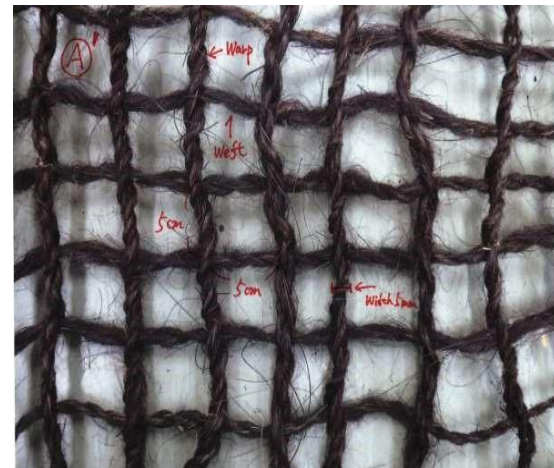
Fig. 2. Examples of dunula nets (fiber) with mesh dimensions of 5cm x 5cm, and 5mm thick.

Palm trees grow a lot and are scattered in the Gorontalo province, so the procurement of this material is quite easy, there are even people who have sold this fiber rope in the traditional market.