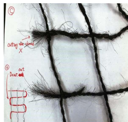
Fig. 4. In this dunula net, the rope on the side of the net will not be cut.