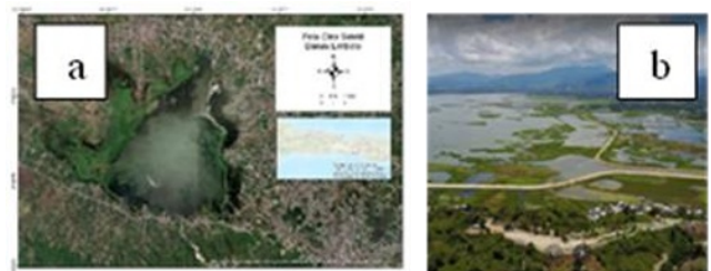
Fig. 1. Limboto lake map showing the location is mainly in Telaga, Batudaa and Kota barat district (a). The photograph of Limboto lake from hills in Dembe village of Kota barat district of Gorontalo city showing the rapid siltation takes place.

Siltation of the lake floor caused by erosion and sedimentation from agricultural activities and illegal logging operations in the forest upstream of Lake Limboto, which is intended to serve as a catchment region.