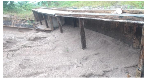
Fig.7. Sediment on the tank.

When retrieving data, the sediment is collected and measured using a bucket with a volume of 3,700 cm 2 (Fig. 7). The data retrieval process is carried out at a time starting from August 22, the sediment reservoir is emptied, and the next sediment collection and measurement is carried out on September 6, 2021.