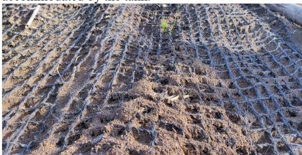
Fig. 6 . Sediment stuck in nets.

Pressure from rainwater causes the release of soil particles then soil starches that are detached from the structure will be transported by the water. This process will be minimized because of the presence of nets as a retainer but there are still soil particles that escape and accommodate in the container box. While in other parts that do not have a net, soil particles transported by water will derail without retaining so that sedimentation in the part without nets will be more accommodated by the tank.