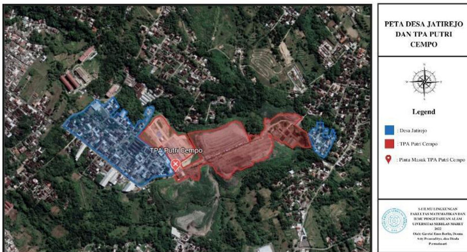
Fig. 1. Satellite Image Map of Putri Cempo Landfill

The research was conducted at Putri Cempo TPA located in Jatirejo village RT 03 RW 39, Kel. Mojosongo, Kec. Jebres, Surakarta City, Central Java. The administrative boundaries of the Putri Cempo TPA are in the east by Ketekan Village, in the west by Jatirejo Village, in the north by Plesungan Village, and in the south by Randusari Village. This assessment was conducted in April 2022 for observation and primary data collection.