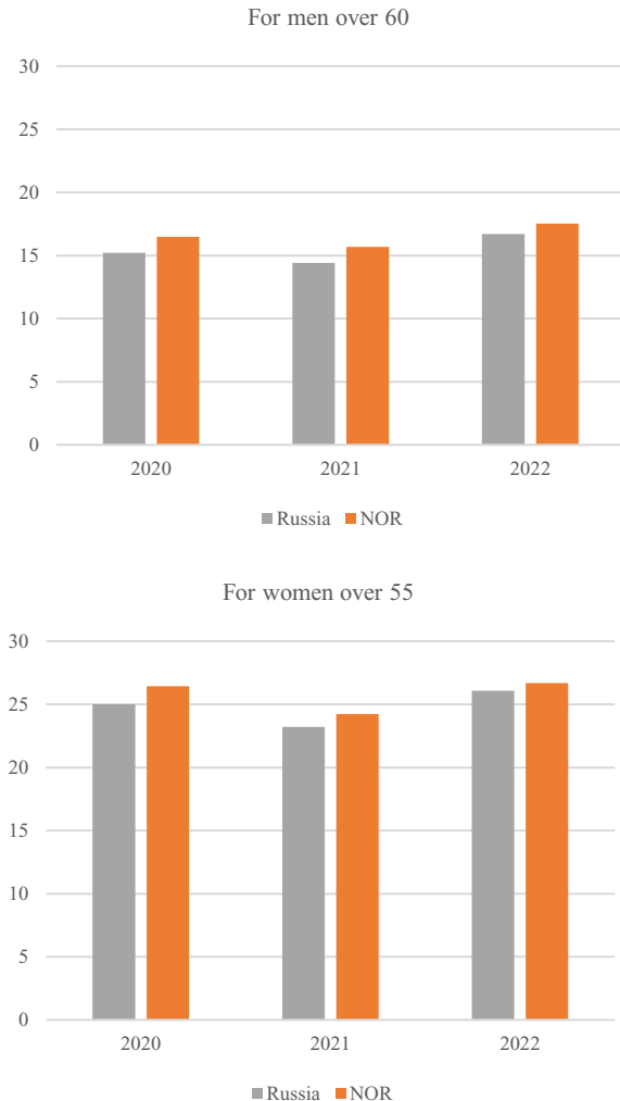
Fig. 2. Expected life expectancy of older people in the Russian Federation and the Republic of North Ossetia-Alania in 2020-2022.

It is obvious that by 2030 every fourth resident of North Ossetia will belong to the older generation. Therefore, the tasks of the regional demographic development in the near future consist not only in creating conditions for natural and migration population growth, but also in creating conditions for the active longevity of the rapidly aging population of the region, whose life expectancy is growing, and at a higher rate than the Russian average (Figure 2).